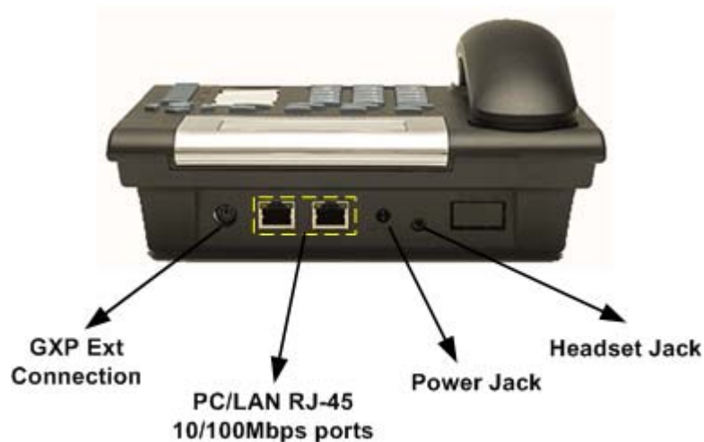
Figure 1: Connectors on the back of the GXP-2000