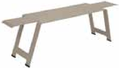
1015 - BENCH Sheet steel bench (0.5")