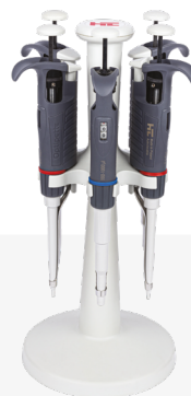
Carousel stand (Cat. No. 5484)

A calibration key is provided with each pipettor to enable user calibration