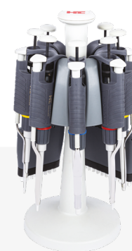
Multiple stand (Cat. No. 5449)