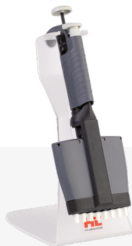
Plexi 1-position stand (Cat. No. 5479)