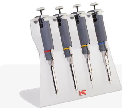
Plexi 4-position stand (Cat. No. 5480)