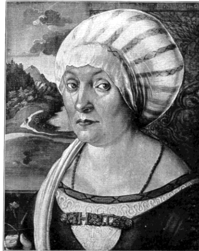
Weimar, Grossherzoggl. Museum