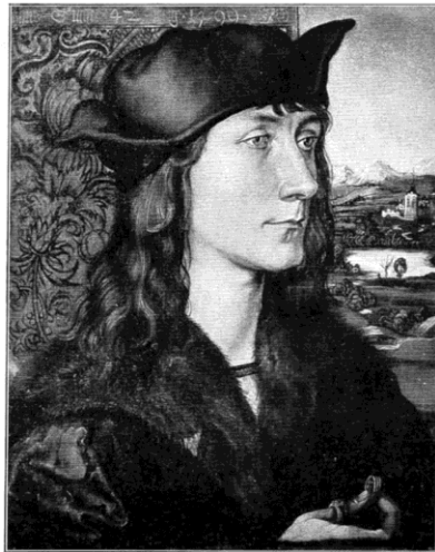
Weimar, Grossherzoggl. Museum