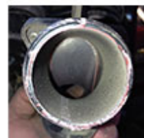
With AirGuard Blockage Prevention System

CALL 1.306.914.3553 or 1.604.744.0070 for more information www.airguardproducts.com