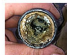
Without AirGuard Blockage Prevention System