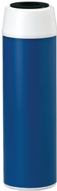
CGT-10S Replacement Cartridge: DEV9108-13