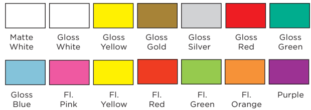
Colors are reproduced as close to true color as possible.

If your design requires the label to be a different size, color or adhesive than is offered in our standard quick delivery program, we will be happy to provide you with a FREE special price quote. CALL TODAY!