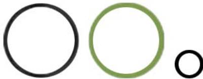
RTF25084 External O-Ring Kit PLD100