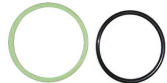
RTF26085 External O-Ring Kit PLD110