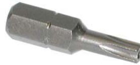
RTF26021 T20 5 Point Solenoid Screw Torx Bit DPE99051-T156 T15 6 Point Solenoid Screw Torx Bit