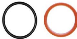
RTF26035 External O-Ring Kit PLD100-110 "B"