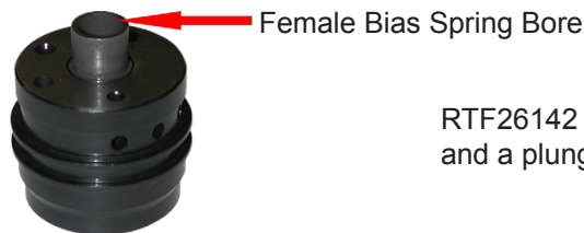
Female Bias Spring Bore

RTF26142 is an assembly with a standard barrel and a plunger with a female bore for the bias spring.