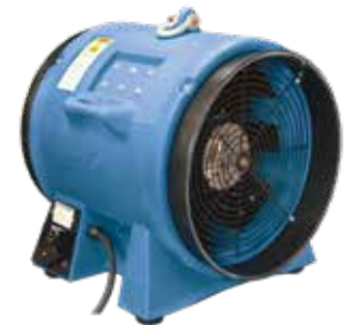
VAF8000A/B 10,000 CFM