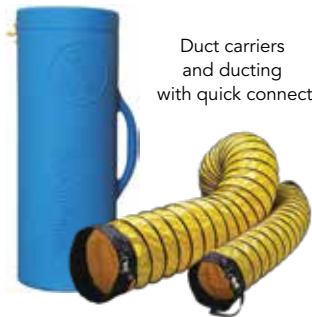
Duct carriers and ducting with quick connect